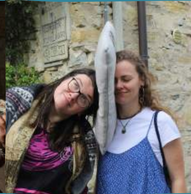
Erasmus YE Team building Liguria Autumn 22