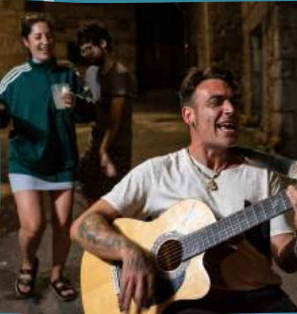
Community Social Dinner Galizia Autumn 22