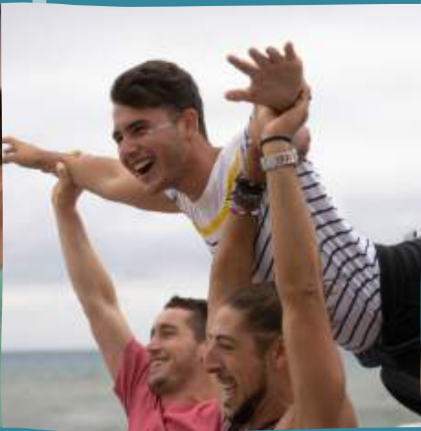
Youth team empowerment Sicily Summer 2021