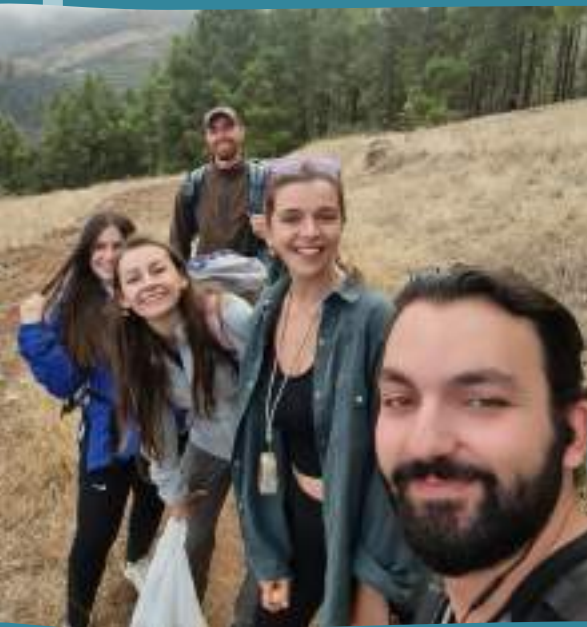
Youth exchange Gran Canaria Spring 22