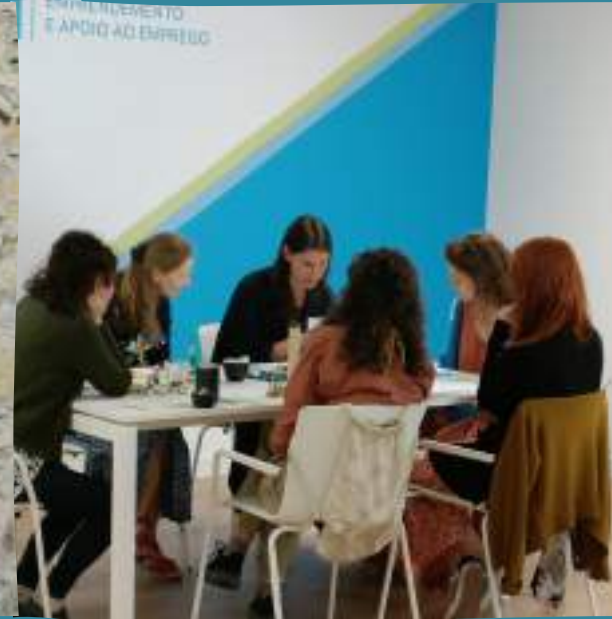
Cross sector meeting design Galizia Spring 23