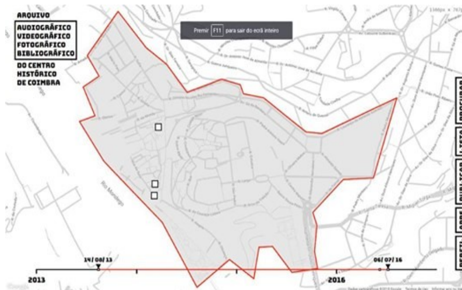
Coimbra's Historic Centre Digital Archive

The Education Project has allowed for a series of projects to emerge, mainly connected with artistic creation (3 performances directed to a younger audience: Jazz é Fixe! [2015], Perder o Chão [2017] and Boca de Incêndio [2018]) and projects such as the Little Improvisors Orchestra (2013/2014), community involvement and civic participation ( Arquivo Digital do Centro Histórico de Coimbra ).