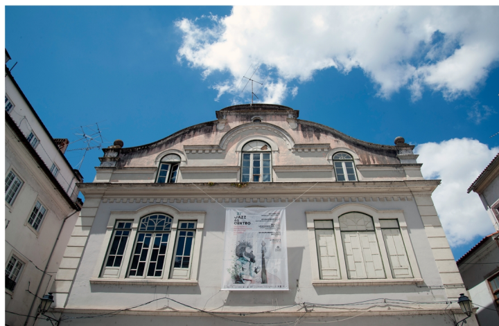
Salão Brazil – Jazz ao Centro's concert venue

In August 2012, after almost 10 years looking for a venue, JACC opened SALÃO BRAZIL o work and performance space right at the heart of Baixa de Coimbra - the historical city center. With 3 days of concerts per week, the venue presents all kinds of music.