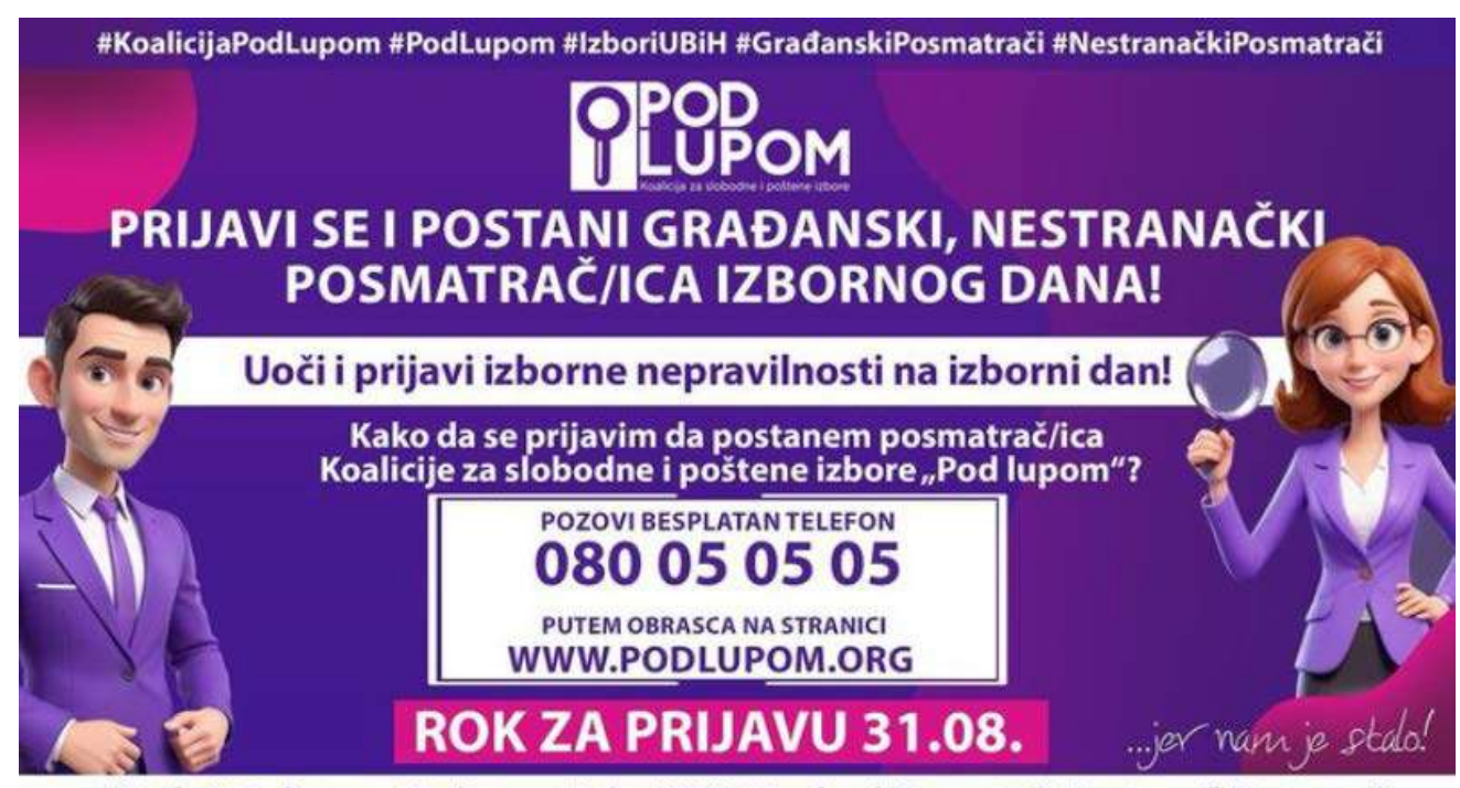
#KoalicijaPodLupom #PodLupom #IzboriUBiH #GrađanskiPosmatrači #NestranačkiPosmatrači

If you come from Srebrenik or Lukavac and want to actively participate in the election observation and earn pocket money, we invite you to apply! Registration is possible through the www.podlupom.org website or by calling the toll-free phone number 080 05 05. Take the opportunity to contribute to democracy in your city and become part of the team of observers in the upcoming elections!